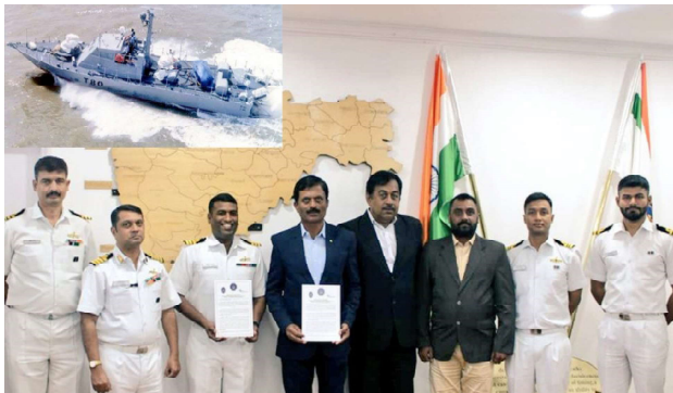
The officers of Indian Navy and SKDCL at an MoU signing ceremony to display decommissioned Indian Naval Fast Attack Craft T-80 as a memorial at Durgadi Sea Fort in Kalyan. (Inset: INFAC T-80).

The "INFAC T-80" was decommissioned on October 07, 2021 at Headquarters, Western Naval Command, Mumbai after rendering yeoman service of 23 years. Built by M/s IAI Ramta at Israel, the vessel was commissioned on 24 June 24, 1998. She was specifically designed for shallow water operations and patrolled extensively to provide